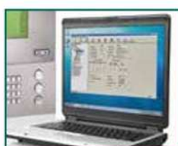
pc programmable easy to use software included