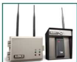
wireless expansion up to 24 entry points