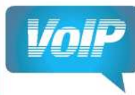
voice and remote programming use almost any phone service and retrofit to older DKS units