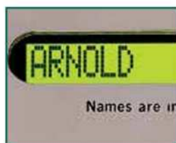
big characters half inch LCD display