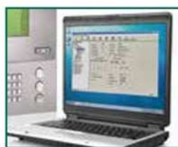
pc programmable easy to use software included