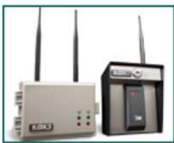
wireless expansion up to 24 entry points