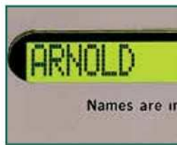
big characters half inch LCD display