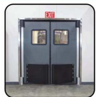
Shown in dark pewter w/ 24" bumpers