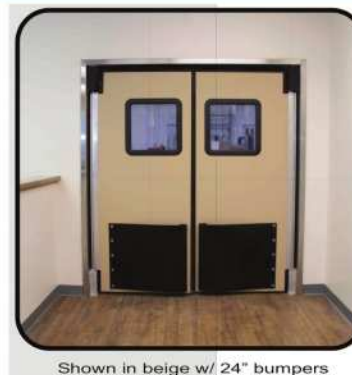
Shown in beige w/ 24" bumpers