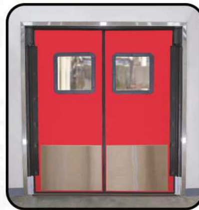
Shown in red w/ 24" kick plates