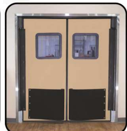
Shown in beige w/ 24" bumpers