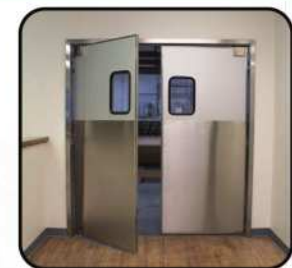
Shown in aluminum w/ 48" stainless steel kick plates