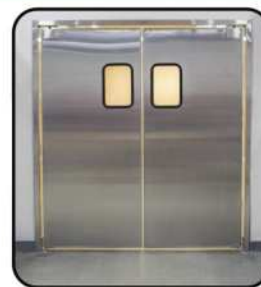
Shown in stainless steel