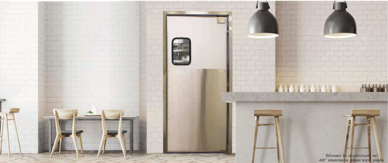
Shown in aluminum w/ 48" stainless steel kick plate

The Hawk Series - Solid Core traffic doors are constructed with a composite wood core bonded with sheets of aluminum, stainless steel, or laminate. These sleek, stout doors are ideal for cafes, restaurants, and hotels.